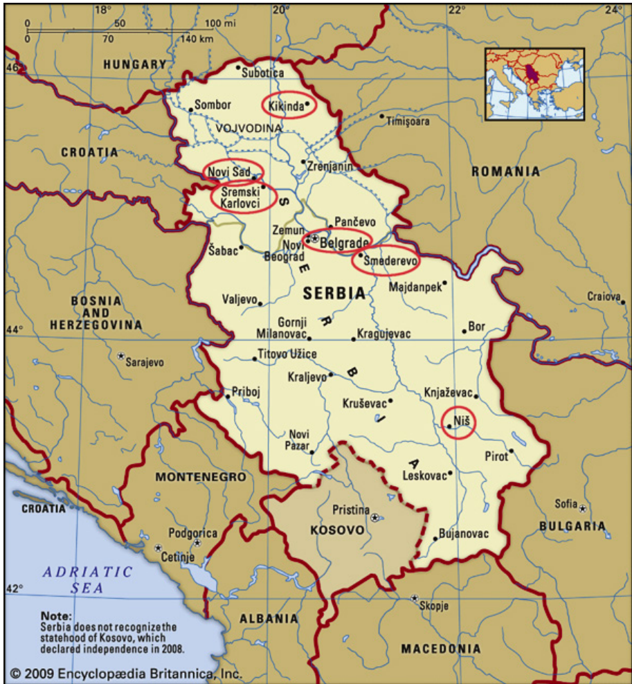
Figure 1: Map of Serbia with municipalities visited by the International Review Team